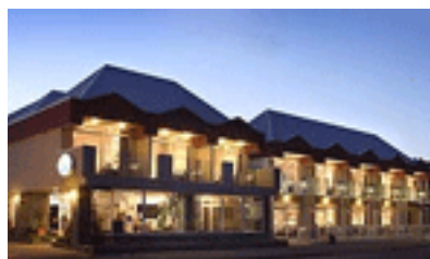
White Morph Motor Inn 92-94 The Esplanade Kaikoura

White Morph Motor Inn offers some of the best accommodation in Kaikoura including luxury spa rooms, superior studios and standard studios.