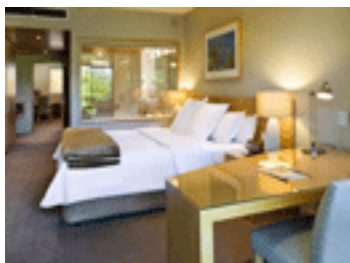
Copthorne Hotel Commodore 449 Memorial Avenue Christchurch