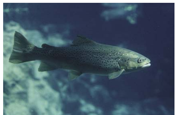
Brown trout.

Spawning periods vary regionally, but the bulk of spawning occurs in May and June; with alevin emergence from the gravel riffles in September-October. Trout may remain in the spawning streams year round.