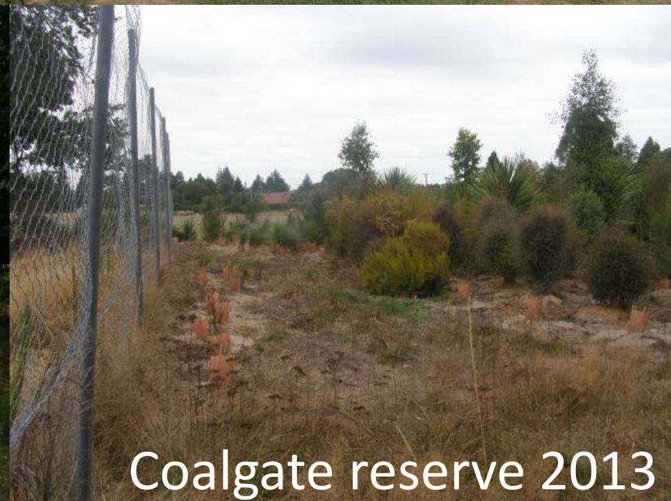
Coalgate reserve 2013