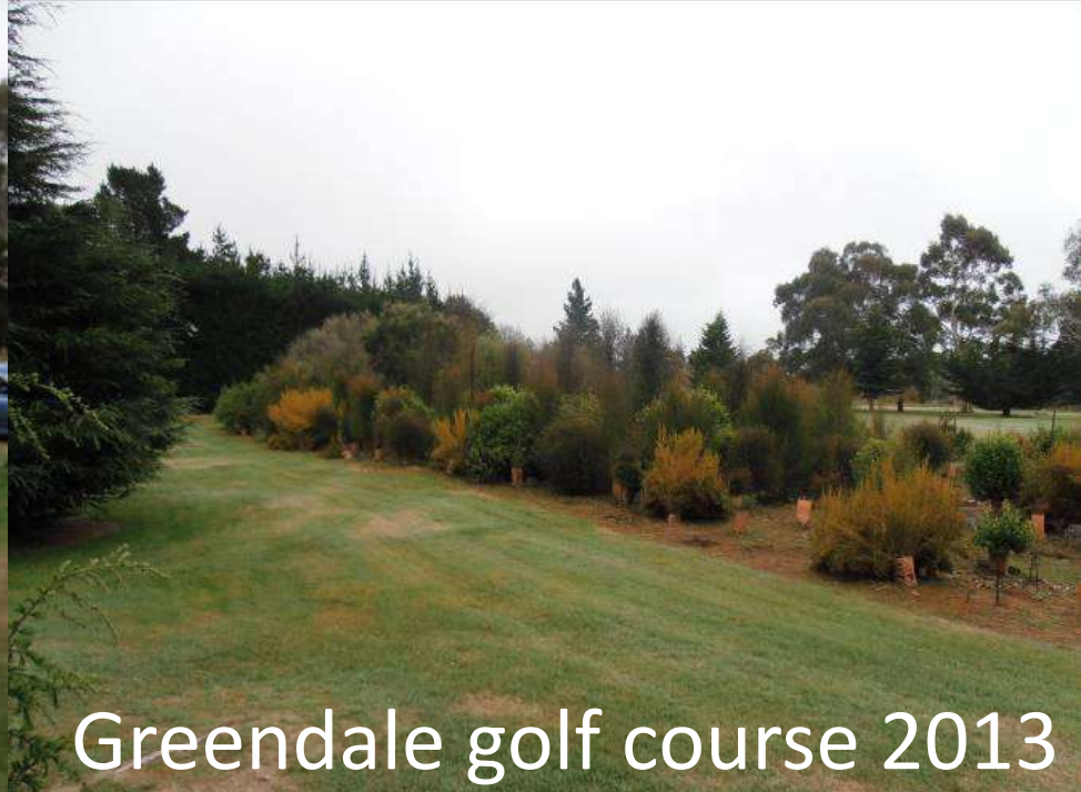
Greendale golf course 2013