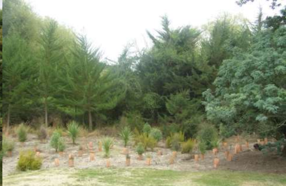
Horrorata golf course 2013