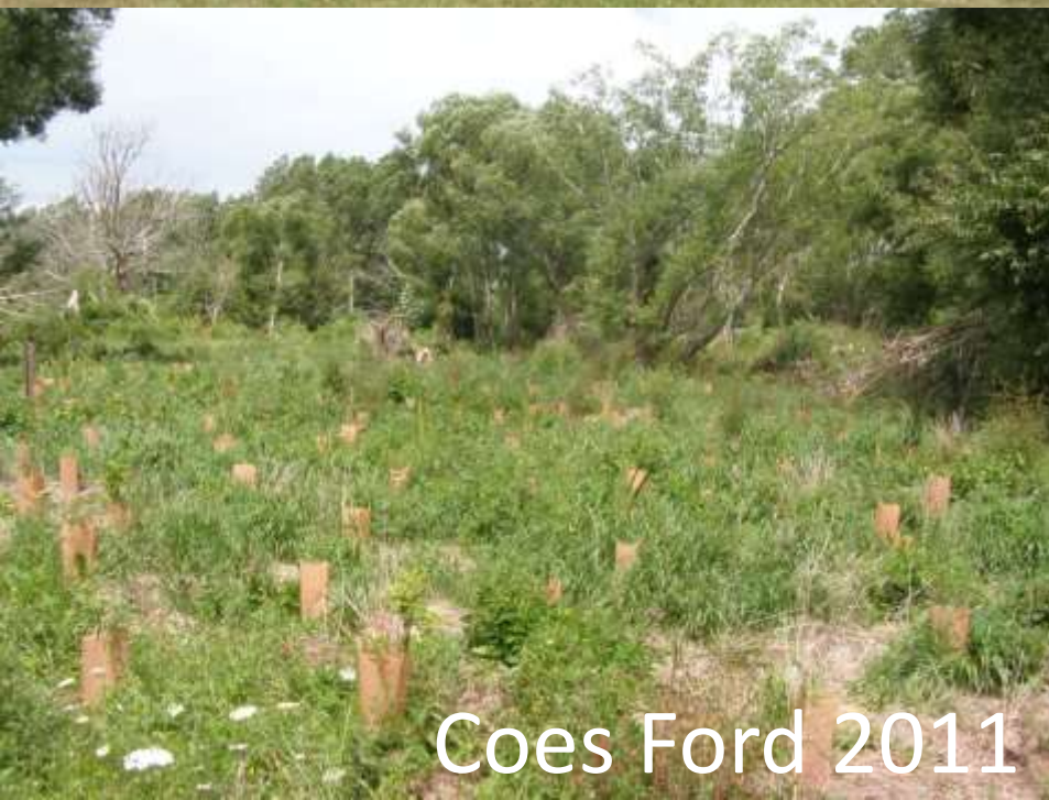
Coes Ford 2011