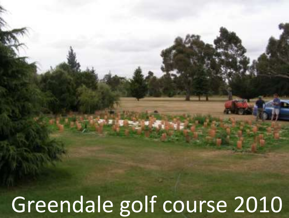
Greendale golf course 2010