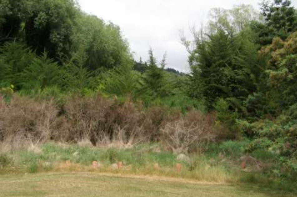
Horrorata golf course 2011