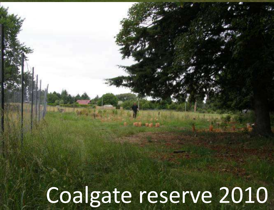
Coalgate reserve 2010