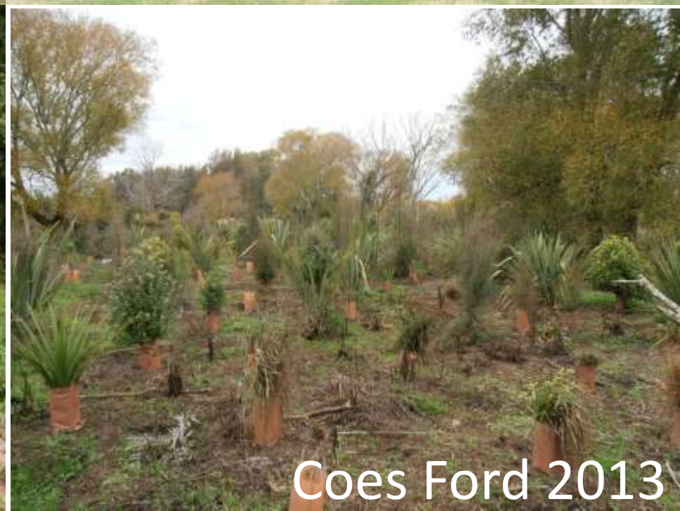
Coes Ford 2013