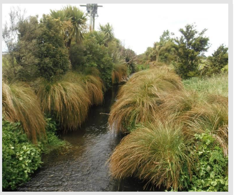
Come for the whole tour or to one site

Predator control in restoration sites: where to start - Craig Alexander (DOC)