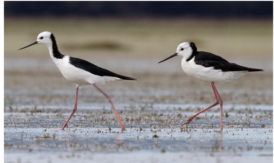
Pied Stilt numbers increased