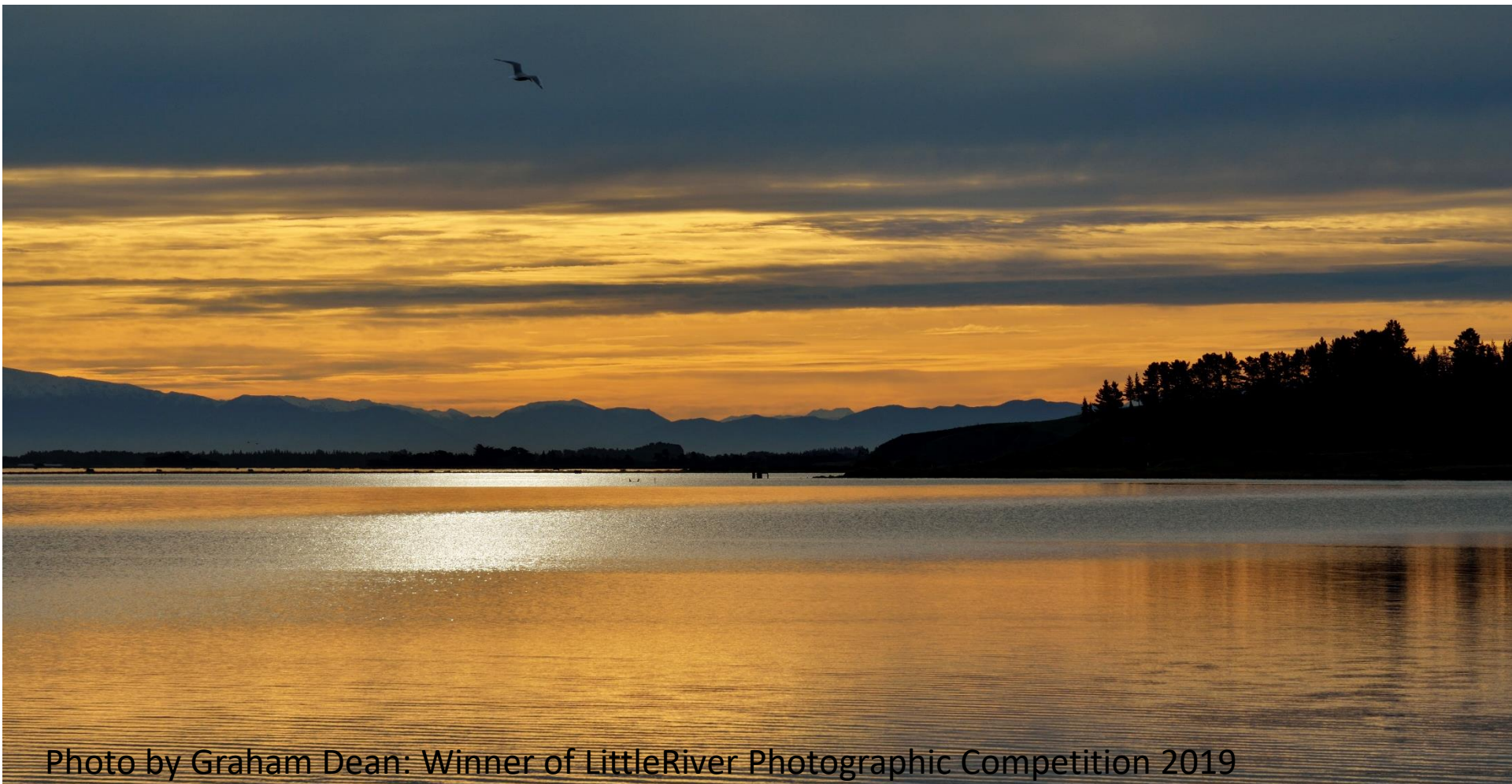
Winner of LittleRiver Photographic Competition 2019